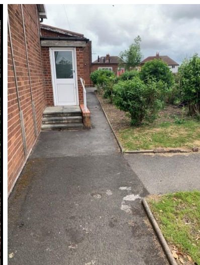
Exit footpath to Saughall Massie Road