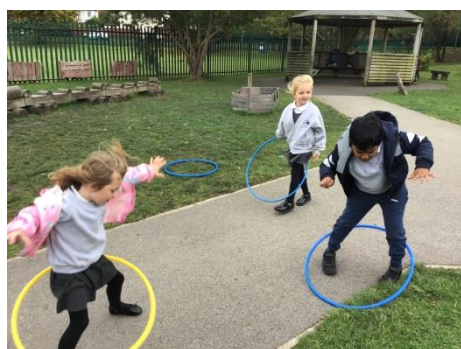
Resilience and friendship