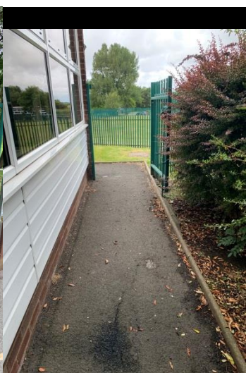
Exit gate towards BHHJS