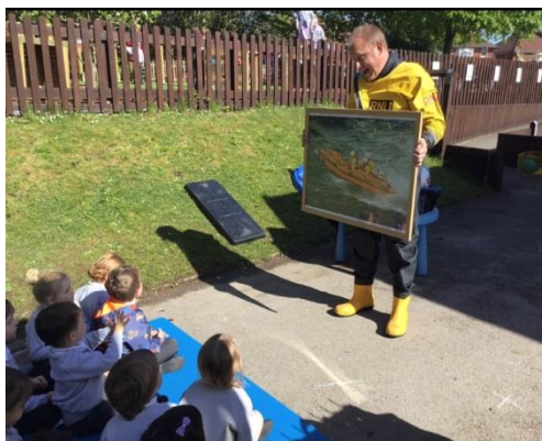
The children had great fun re-creating daring sea rescues in the role play area.