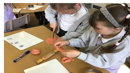
In maths Year 2 have been finding out about fractions.