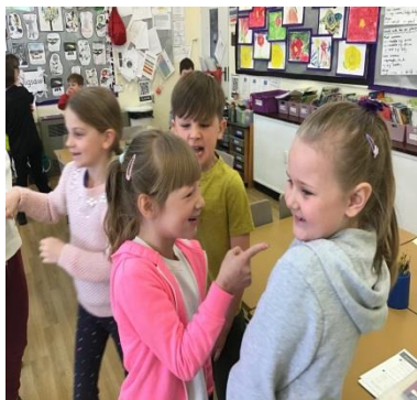
In 2TM the children practised new vocabulary by acting out a story.