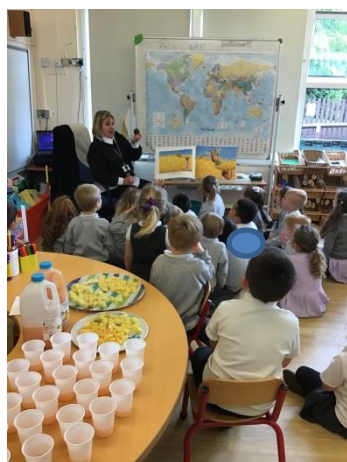
F2 have been finding out about Africa. They have found out that people live in cities and villages. Further learning took place about the animals that live in Africa.