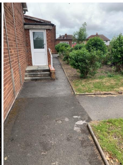
Exit footpath to Saughall Massie Road