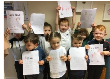
Our fabulous F2 authors