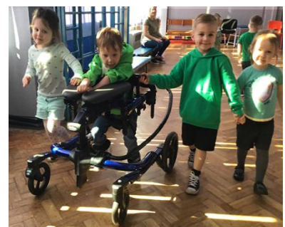
Cerebral Palsy awareness day

It is clear from speaking with the children and looking at their learning that they are benefiting from minimal disruption to their education. It was disappointing that parents/carers were unable to see their children's books because we conducted our parent teacher meetings over the telephone. It is for this reason that we have set some dates for you to come in and have a look with your children at all of their fabulous learning. Due to space in the classroom we politely request that only one adult per child attends the session.