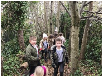
Year 1 looking for Wild Things in the woods as part of their literacy work