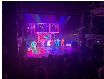
Year 2 had a theatre trip