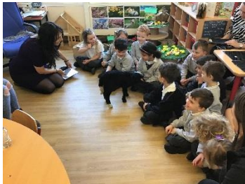
A lamb visited school

It is hard to believe that we are now two-thirds of the way into the academic year and the children only have one term left in their current year group. We've had a really enjoyable half-term in school and there have been a range of wonderful learning opportunities and events happening for the children.