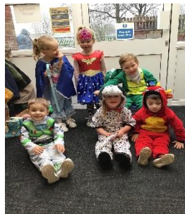
World Book Day fun!