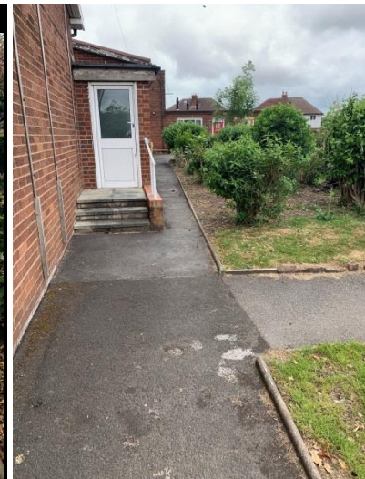
Exit footpath to Saughall Massie Road