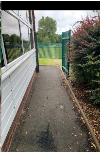
Exit gate towards BHHJS